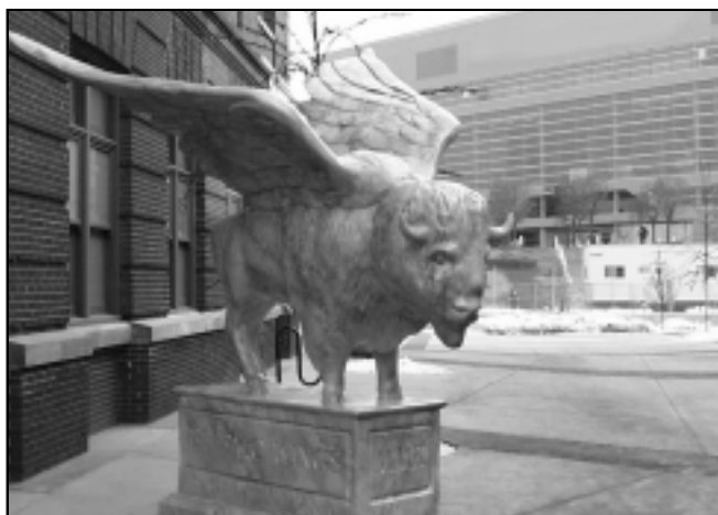
A newly-erected statue in front of the New York Stock Exchange declares to economic leaders, it’s not a bear or a bull, but a “Buffalo” market.

According to Marsalavich, “In searching for reasons behind the economic downturn, we explored every angle – foreign relations, consumer behavior, quesadillas. But when we got to Buffalo wings, the