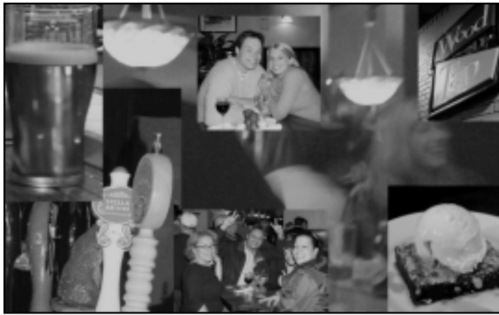
The Wood-n-Tap serves 100s of people a night, a far cry from everyone.

While the owners have exciting plans for expansion, they continue to ask everyone to arrive in shifts rather than all at once.