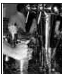
PerfecTap. It's the reason the beer here is better than the beer there.

PerfecTap is now in use at all 4 Wood-n-Tap locations. The owners invite you to come in and taste the difference for yourself.