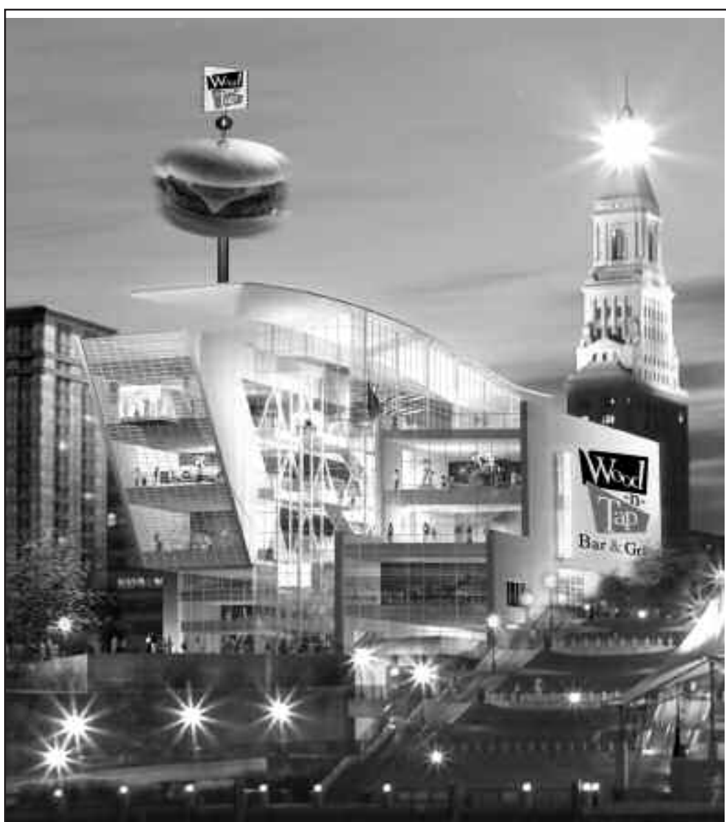
An artist's rendering of the completed Wood-n-Tap Downtown, perched magnificently beside the river. Majestic "Cheeseburger Tower" features 35 foot wide buns and 6 tons of beef (weight before cooking).

Bar-n-Grill-n-Science Center Will Change Hartford's Skyline