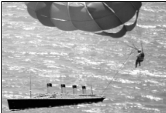
Despite historical inaccuracies, Titanic's alternate ending is no less exhilarating than the original, evidenced by the climactic parasailing scene.

Titanic Special Edition hits video stores in late April. It is rated NC-17.