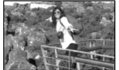
I’m the king of the people who say “I’m the king of the world.”