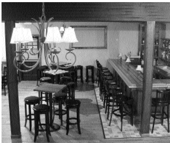
Wood-n-Tap's back bar. More of a good thing.

The new back bar features additional table seating for dining and a second fully-staffed bar. It is the ideal spot for private parties, but what's more exciting is the live entertainment lineup the owners have slated for the future. In addition to popular local bands, expect to see everything from live comedy shows, to movie screenings, to